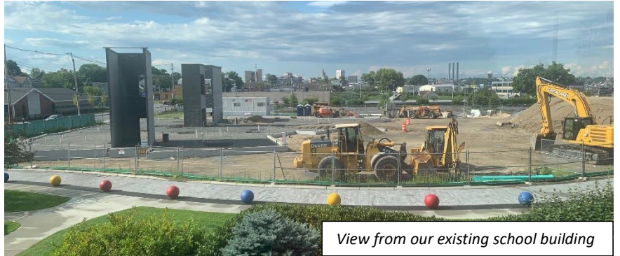
View from our existing school building

We are 12 weeks into construction and progress is visible on the Center for Early Childhood Development, the latest addition to our Providence campus. Upon its opening in August 2024, the two-story building will be the home to all of Meeting Street's early childhood programs for children prenatal to age five, including the Early Childhood Connection Continuum we told you about in our last issue .